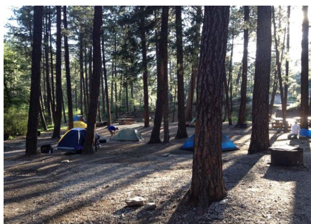
Rose Canyon Lake Campground

July 2, Day 2: Saguaro National Park; Catalina Mountains. After an early breakfast, we'll visit Saguaro National Park on the east side of Tucson. An eight-mile loop drive through the beautiful Sonoran Desert will provide an excellent introduction to the flora and fauna of the Southwest. Set amid towering saguaro cactus (pronounced sah-war-o), thickly foliated mesquite and palo verde, barrel cactus and ocotillo, our visit here will be both spectacular for scenery as well as productive for wildlife. Birds we may expect to see here include Gilded Flicker, Gila Woodpecker, Ash-throated Flycatcher, Verdin, and Rufous-winged Sparrow, and herps may include Zebra-tailed Lizard and Western Whiptail.