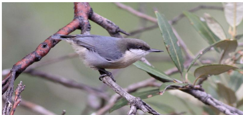
Pygmy Nuthatch

NIGHT: Camping at Rose Canyon Lake, Catalina National Forest