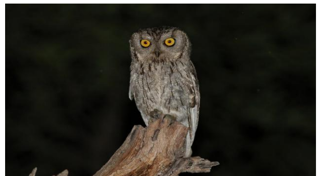
Western Screech-owl

Nighttime in the Chiricahuas reveals another face to this wondrous place. A whole host of birds, insects, reptiles, and mammals emerge after the sun goes down and the heavens fill with millions of stars. We'll go on a nightbird prowl one night after dinner. The voices of Elf Owl, Western and Whiskered screech-owls, Common Poorwill, and Mexican Whip-poor-will elevate the ambience of a Chiricahua summer evening, and we have decent chances of seeing some of these nocturnal sprites. On another evening we will load up and head out to the desert for a night drive. Cruising lightly traveled side roads brings opportunities for a variety of other critters, including snakes, toads, kangaroo rats, scorpions, and tarantulas.