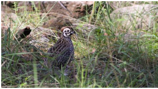
Montezuma Quail © Michael O'Brien

provides a year-round source of water, and this allows trees like oaks and sycamores to become established. The drier hillsides are dominated by a high desert plant community, with sotol and agaves decorating rocky hillsides. This area is, in fact, another major transition zone, where a variety of habitats come together. The great mix of trees and plants are paralleled by an interesting mix of birds. Specialties here are Woodhouse's Scrub-Jay, Juniper Titmouse, Crissal Thrasher, Rufous-crowned and (rarely) Black-chinned sparrows, and Scott's Oriole. Near