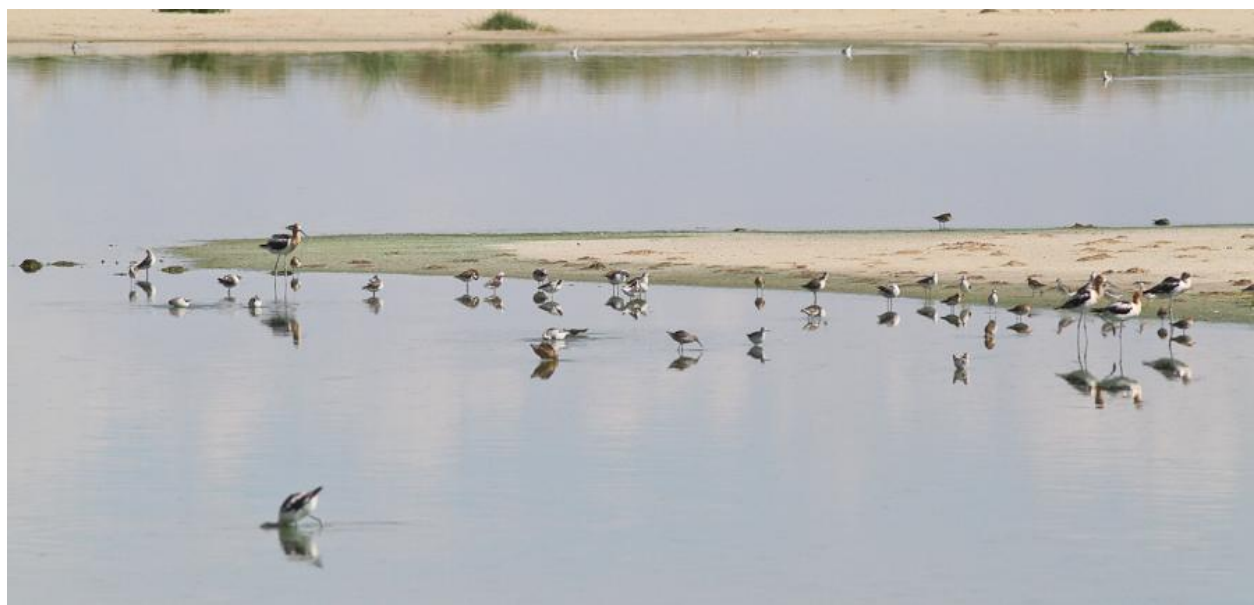
Shorebirds at Lake Cochise

To break up the drive, we'll make a midday stop at Lake Cochise on the west side of Wilcox. Really a large municipal wastewater treatment pond, the "lake" is the single most famous birding location in the entire Sulphur Springs Valley. The interface of man-made and natural habitats found here provides food and shelter for an impressive diversity of birdlife all year long, and the presence of permanent water represents an important refuge in a region nearly devoid of large bodies of water. An astonishing array of birds has been recorded here through the years, and we hope to encounter a variety of waders and grassland species, as well as any surprises that may turn up. Wayward gulls and terns are frequently found here, and the open water often holds a variety of summering ducks and grebes. The first southbound shorebirds will provide some identification challenges, and such dandies as Wilson's Phalarope and Baird's Sandpiper are likely. American Avocets nest here in some years, and Yellow-headed Blackbirds breed in the reed-lined ponds. Swainson's Hawks, Scaled Quail, Horned Lark, and Chihuahuan Meadowlark are typical sights of the grasslands. In the distance the Chiricahua and Dos Cabezas mountain ranges form a backdrop of considerable panoramic beauty.