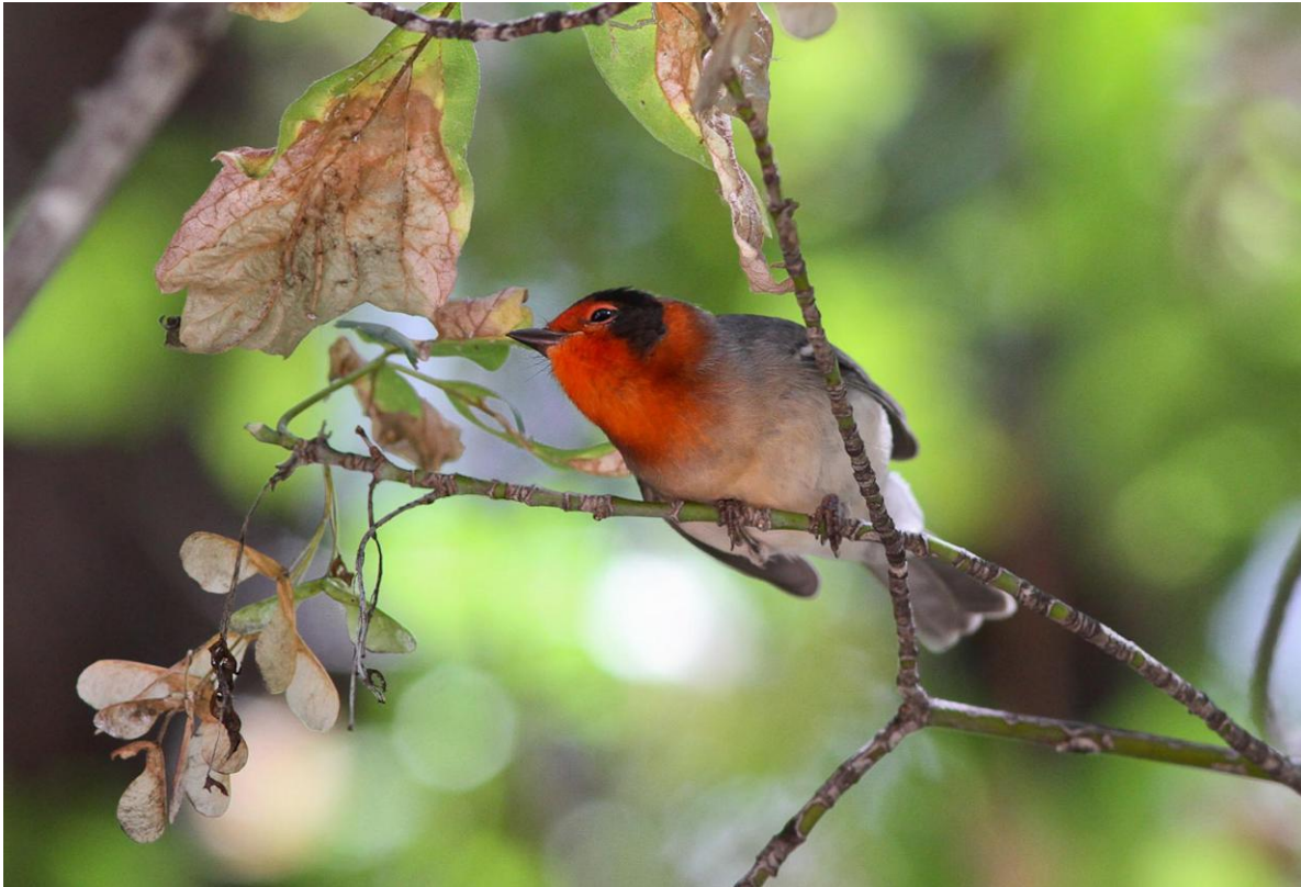
Red-faced Warbler

Camp Chiricahua, co-sponsored by Black Swamp Bird Observatory (Ohio), offers young naturalists between the ages of 14 and 18 the opportunity to explore the biologically rich ecosystems of Southeast Arizona, centering on the famed Chiricahua Mountains.