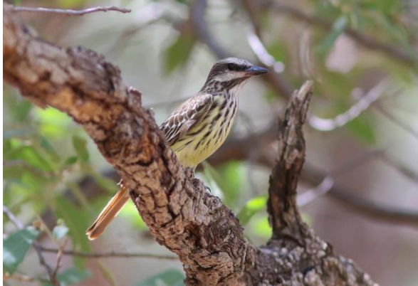
Sulphur-bellied Flycatcher

Cave Creek Canyon – One of the most exciting days will be our first visit to the South Fork of Cave Creek. This is a beautiful riparian habitat in the lower elevations of the Chiricahuas, where oaks, sycamores, pines, and cypress provide shade for the lush green undergrowth. The birds here are wonderful; Elegant Trogon must lead the list, but Blue-throated Mountain-Gem, Arizona Woodpecker, Sulphur-bellied and Dusky-capped flycatchers, Hutton's and Plumbeous vireos, Grace's Warbler, Painted Redstart, and Hepatic Tanager are nearly as special. We'll spend as much time as possible in this very rich area, observing how the habitat becomes much drier as soon as one leaves the shaded canyon and starts up the mountain slope.