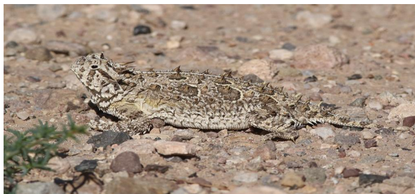
Texas Horned Lizard

Berylline are regular, and trails through mountain canyons are home to the likes of Elegant Trogon, Arizona Woodpecker, Sulphur-bellied Flycatcher, Mexican Jay, and Hepatic Tanager. In the late afternoon we'll return to our hotel in Tucson. After a well-deserved dip in the pool, we will meet for a final group dinner.