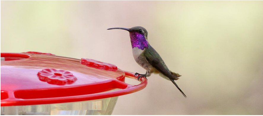
Lucifer Hummingbird

The summer months are a fabulous time for hummingbirds in southern Arizona, and no place is more reliably productive than the Huachucas. Vigils at feeding stations may yield up to a dozen species. Beside the quality, we can expect quantity. Dozens of hummers are typically zipping around the feeders at all times; feeding, chasing and fighting. Black-chinned, Broad-billed, and Anna's are most