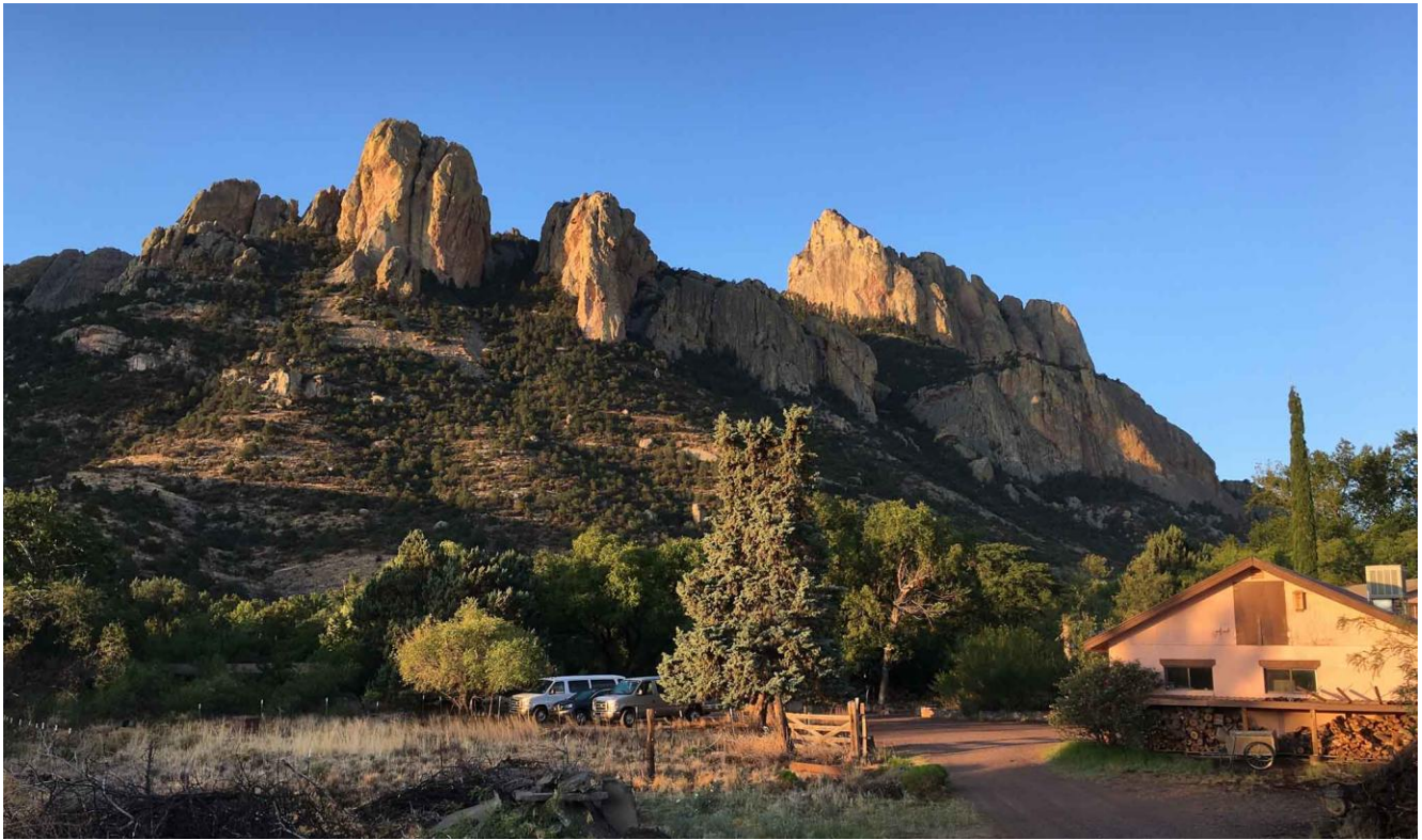
Cave Creek Ranch

Starting in Tucson, we will first do some desert birding on the east side of town before ascending Mount Lemmon in the Catalina Mountains. Two nights of camping in the forested highlands will acquaint us with the “sky islands” so very characteristic of the borderlands of Southeast Arizona.